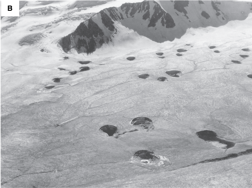
FIGURE 10.5. (A) A model for meltwater drainage routes. From Rothlisberger and Lang (1987). (B) Dendritic meltwater streams and small hollows, Black Rapids Glacier, Alaska range. From Post and LaChapelle (2000).